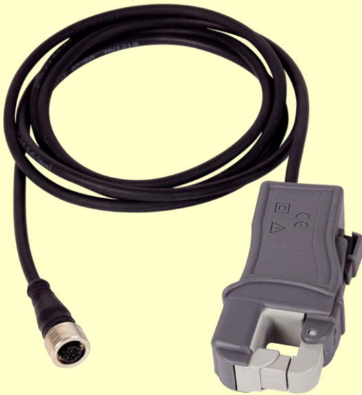
Figure 1: 15 series CAT III 600V current clamp-on probe

The 15 Series CAT III 600V AC Current Clamp-On Probes are a high performance current sensor incorporating a split iron core window current transformer with low ratio and phase errors, specifically designed as an accessory for CHK Power Quality instruments and in CAT III environments.