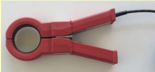
Figure 1: 52 series CAT IV 600V AC/DC current clamp-on probe

The 52 Series CAT III 600V AC/DC Current Clamp-On Probes are high performance current converters incorporating a Hall Effect sensor within a split core window current transformer with low ratio and phase errors, and specifically designed as an accessory for CHK Power Quality instruments and used in CAT III 600V environments.